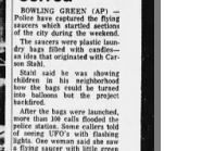
SAUCER MYSTERY SOLVED—Police officers in Bowling Green, Ky., have solved a mystery that had puzzled the community for weeks.

Rowling Green (AP)—Police officers in Bowling Green, Ky., have solved a mystery that had puzzled the community for weeks.