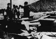
SAUCER MYSTERY SOLVED—Police officers in Bowling Green, Ky., have solved a mystery that had puzzled the community for weeks.

Rowling Green (AP)—Police officers in Bowling Green, Ky., have solved a mystery that had puzzled the community for weeks.